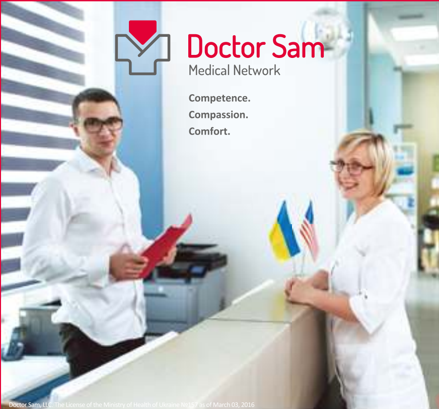
Doctor Sam, LLC. The License of the Ministry of Health of Ukraine №197 as of March 03, 2016