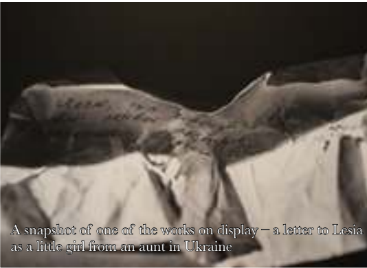
A snapshot of one of the works on display – a letter to Lesia as a little girl from an aunt in Ukraine