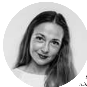
Aivaras Abromavičius – former Minister of Economy and Trade

After the magazine's closure, I worked as the chief editor for the Ukraine Today website – the first national English-language channel launched in August 2014. In addition to coverage of the Donbas conflict, our content ranged from global breaking news to local sports, culture, social, and lifestyle pieces. Since October 2016, I have been with DEOL Partners, a leading real estate company that operates four high-profile hotels in Kyiv. I joined the WO team during the 2013-2014 EuroMaidan Revolution, when anti-government protests were taking place in Kyiv's central square. Those three months shook the world, yet gave us hope. And this hope inspires us now to write a new and much more exciting chapter in the WO life!