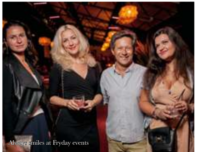
Always smiles at Fryday events