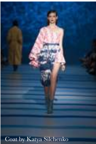
Coat by Katya Silchenko