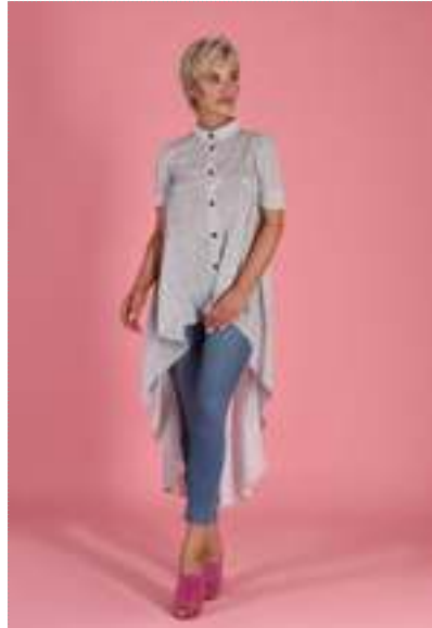
fabrics – eco-friendly viscose and organic cotton. Design by #LOVEip

It's one of the reasons, at #LOVE, we believe if you want to invest in a cutting-edge piece of fashion, do it with an outstanding pattern that reflects a brand's design, or invest in a classic silhouette. For example, when the oversized Soviet-style jean jacket started finding its way into collections around the world, #LOVE came up with its own jean bomber jacket, and